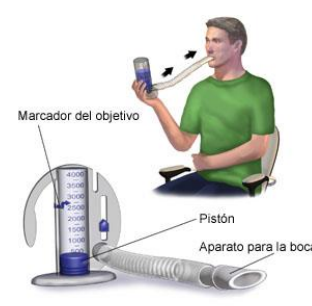
Forma de usar un espirómetro de estímulo

spirometers are mainly of flow or volume and there is normally misuse because the patient tends to take rapid breaths without controlling the volume of air inhaled. This is why the use of the volume-oriented spirometer is recommended; cumulative spirometry. This limits pain and assists in muscle rest.